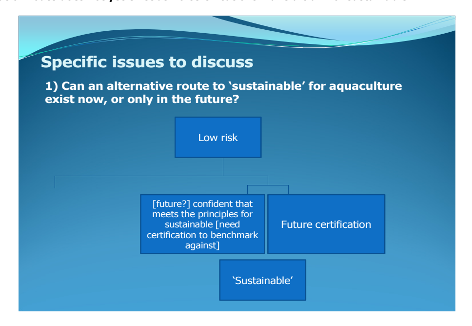
Figure 4: Slide from labelling presentation showing decisions for low risk outcomes for aquaculture in relation to 'sustainable' claims, agreed at aquaculture focus group on 27.06.12. Wild-capture in version 4 has an alternative, non-certified route to 'sustainable', through confidence that there is consistence with the principles for 'sustainable', which are to be built in to the guidance. For aquaculture, the certification route does not yet exist as no certifications make a claim of sustainable.

Members were asked to discuss whether this alternative route can currently be achieved in some cases e.g. Rope grown mussels, integrated multi-trophic? If so, what is this benchmarked against?