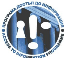
Access to Information Programme, Bulgaria