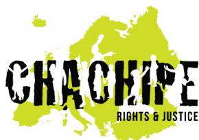
Chachipe a.s.b.l, Luxembourg