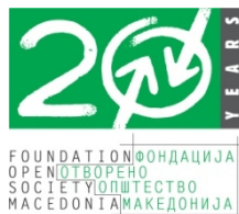
Open Society Foundation – Macedonia