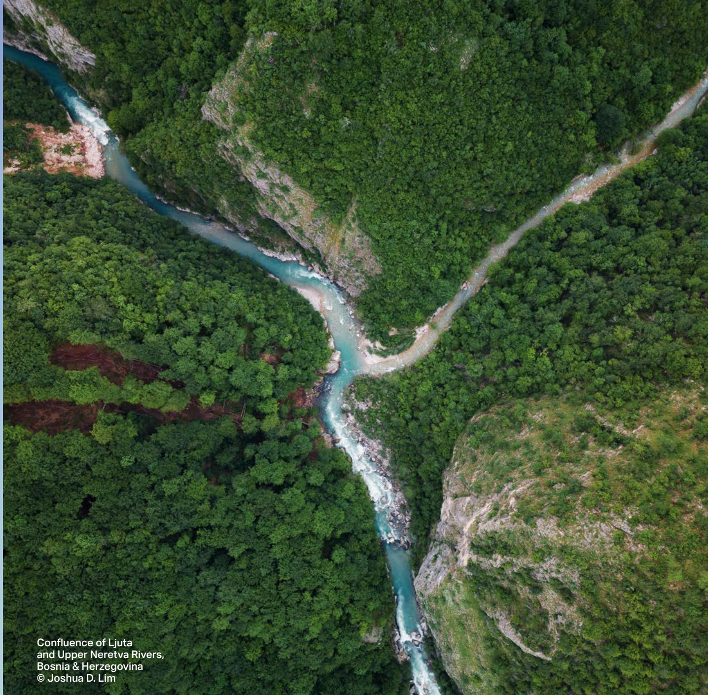
Confluence of Ljuta and Upper Neretva Rivers, Bosnia & Herzegovina

This report provides an interim evaluation of the extent to which the Western Balkan countries, namely Albania, Bosnia and Herzegovina, Kosovo, Montenegro, North Macedonia and Serbia are safeguarding their rivers by incorporating pivotal EU Directives relevant to hydropower projects into their national laws.