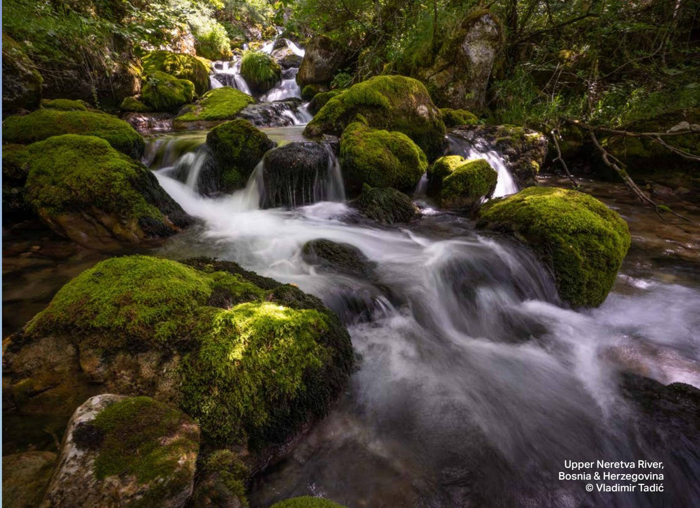
Upper Neretva River, Bosnia & Herzegovina