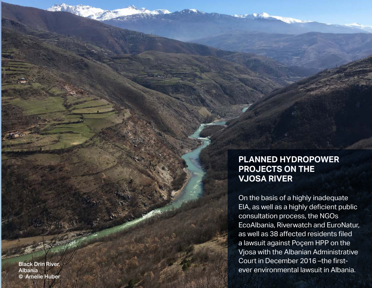
Black Drin River, Albania