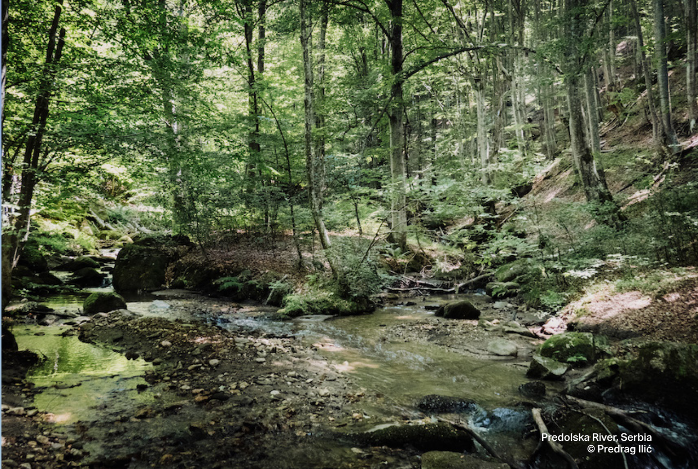
Predolska River, Serbia

mining, energy, traffic, water industry, agriculture, forestry, hunting, fishing, tourism and other areas that have an impact on nature.