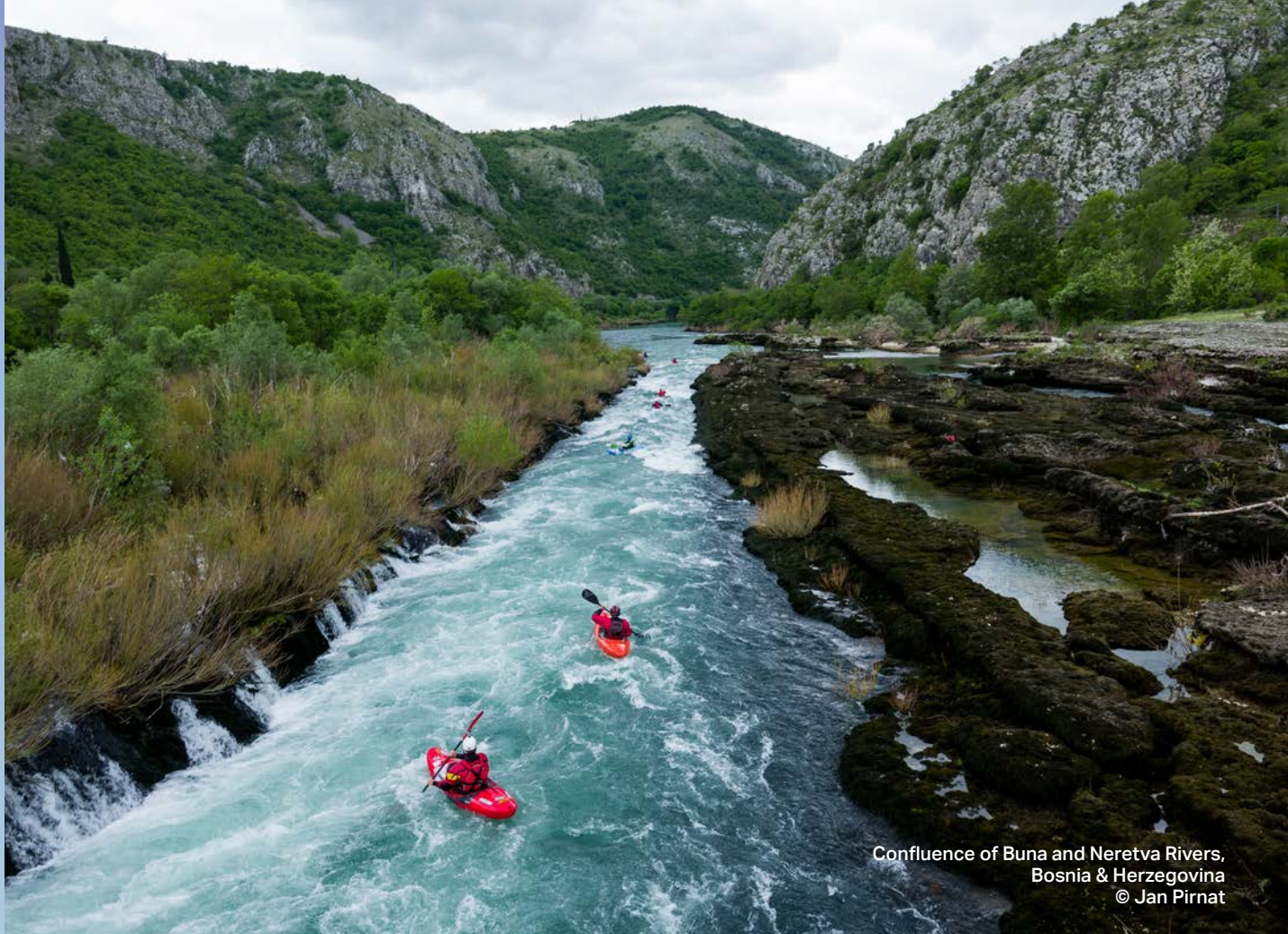
Confluence of Buna and Neretva Rivers, Bosnia & Herzegovina