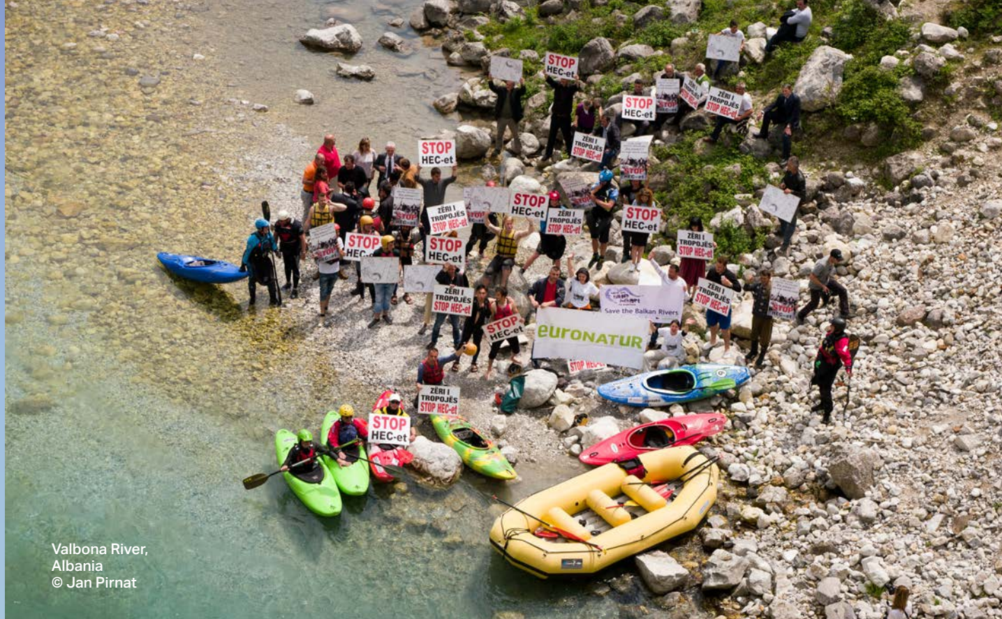
Valbona River, Albania

scope and level of detail of the information to be included by the developer in the EIA report are conducted.