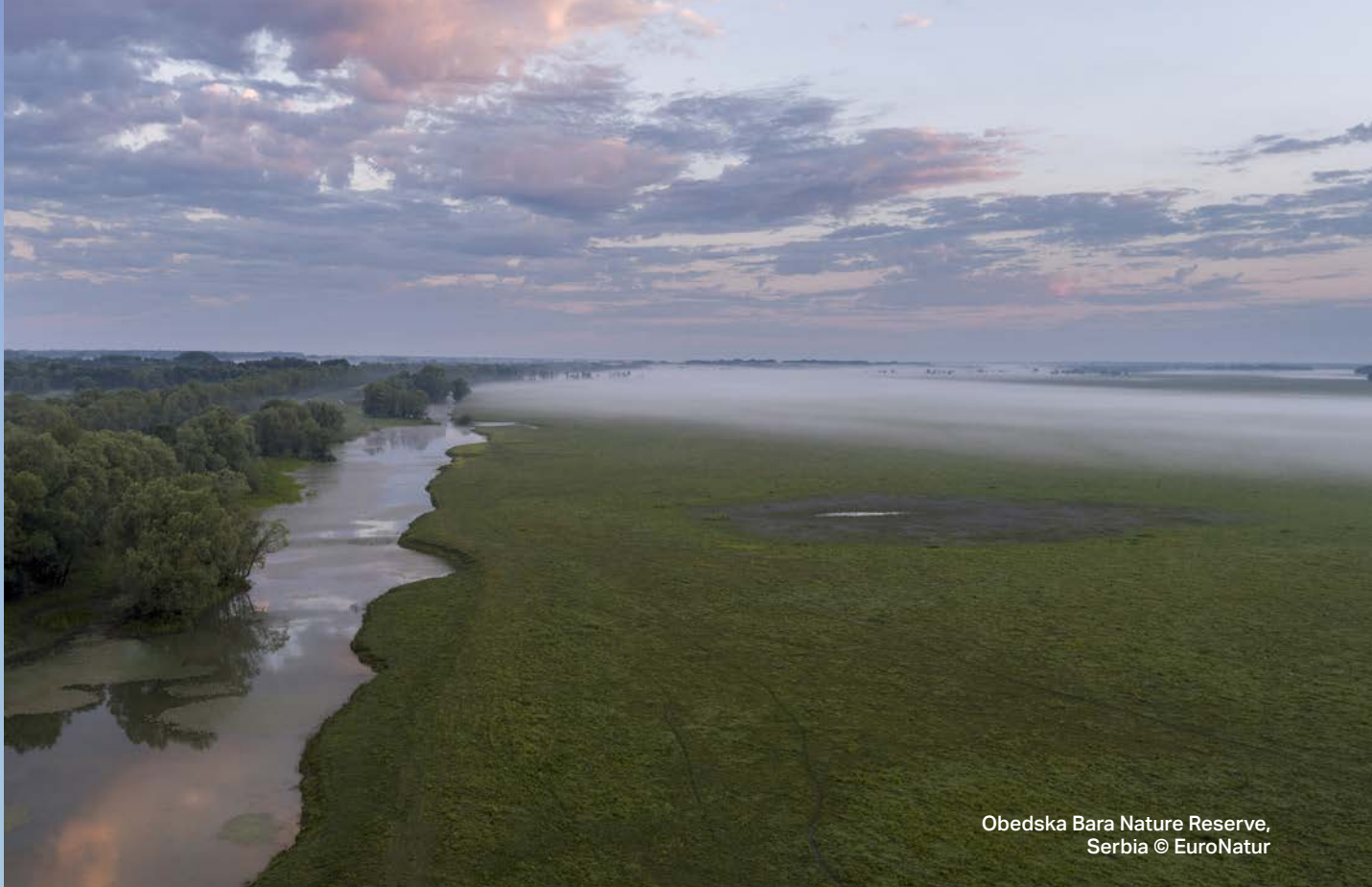
Obedska Bara Nature Reserve, Serbia