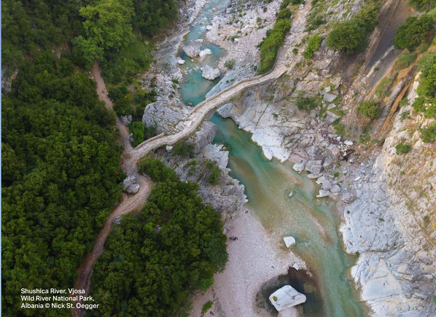
Shushica River, Vjosa Wild River National Park, Albania

Article 52 of the Law provides that individuals or legal entities and environmental associations in the territory, which are directly affected or suffer the consequences of the damage caused to the environment, have the right to ask the National Environment Agency to request from the operator: