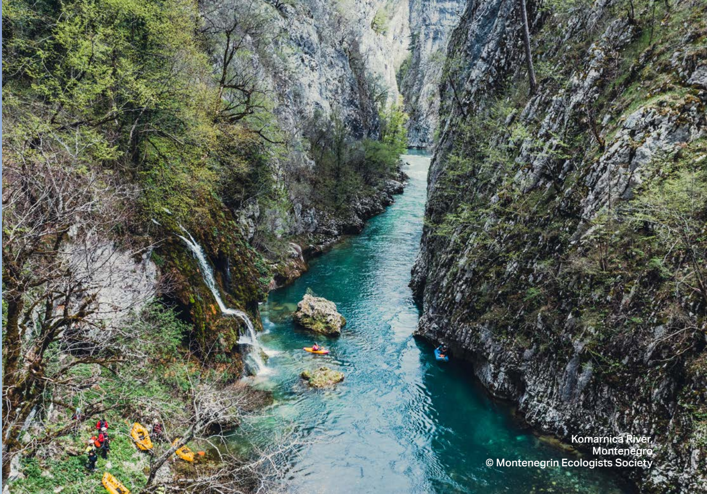
Komarnica River, Montenegro

remediation measures will take place. These opinions, together with the risks for human health, nature, scope and difficulty of damage, will be taken into account by the competent authority, when granting an approval. For this purpose, the competent authority shall form a Commission for approval. The Commission shall consist of specialists in each area of the environment, representatives of the competent authority and Ministry, as well as the representatives of relevant institutions for the environment ( Article 19 of the Law ).