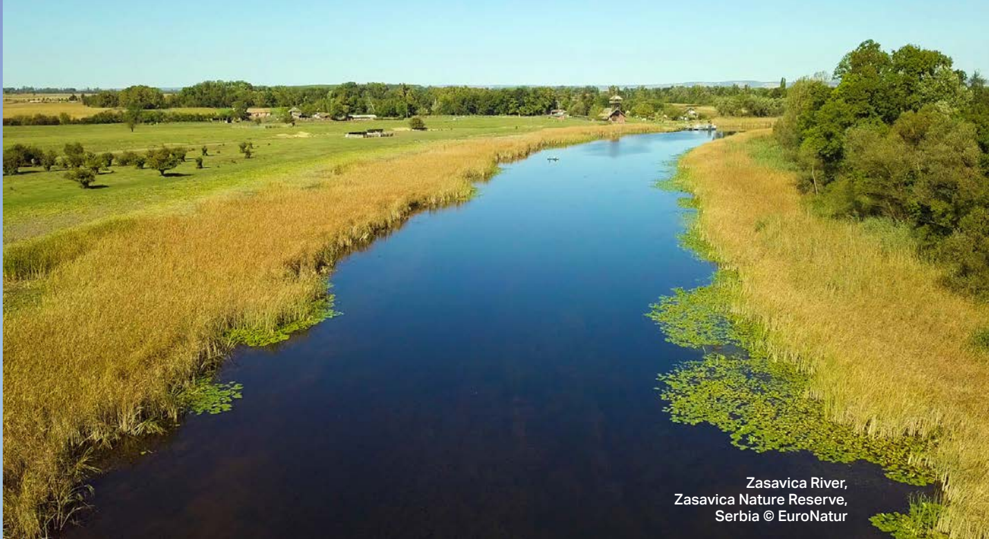
Zasavica River, Zasavica Nature Reserve, Serbia

Similarly to the draft EIA Law, the draft SEA Law is successfully harmonising the SEA procedure with the appropriate assessment by incorporating the appropriate assessment procedure into different phases of the SEA procedure. For instance, Article 9 of the draft Law that regulates the preliminary phase of the SEA procedure, states that the decision on the need to carry out the SEA procedure includes, among others, the decision on preliminary appropriate assessment, conducted by the competent authority. Article 14 of the draft Law states that a Report on SEA procedure includes, among others, the decision of the competent authority on the appropriate assessment procedure, and that the Report needs to separately include information on the ecological network and measures for prevention and mitigation of negative impacts of the plan and programme on the ecological network.