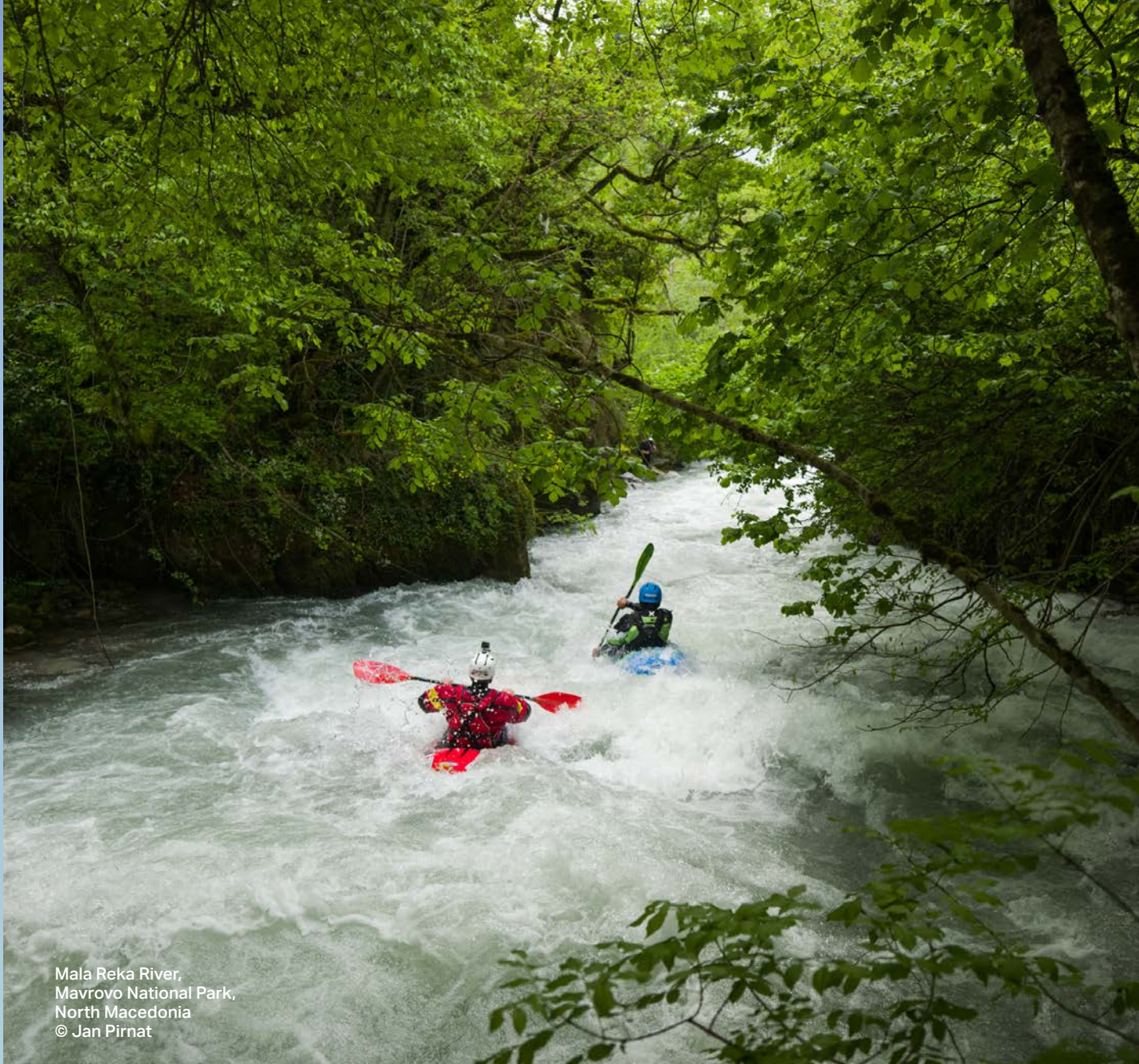
Mala Reka River, Mavrovo National Park, North Macedonia