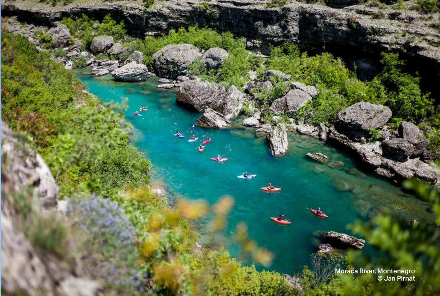
Morača River, Montenegro

The Law also introduces the Commission for Impact Assessment ("Commission") that is obliged to determine the scope and content of the elaboration and assess it ( Article 21 of the Law ). The Law states that the members of the Commission can be comprised not only from within the competent authority, but also among other professionals. The Internal Rulebook on formation of the Commission 137 further regulates the procedure for formation of the Commission and public tender for selection of members, external to the competent authority. The Law thus allows even for the member of civil society to be part of the Commission.