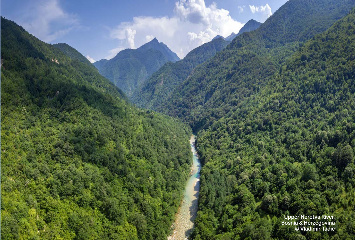
Upper Neretva River, Bosnia & Herzegovina

Regulation on means of participation of the public in water management further regulates public participation in the area of water management by ensuring public participation during the: