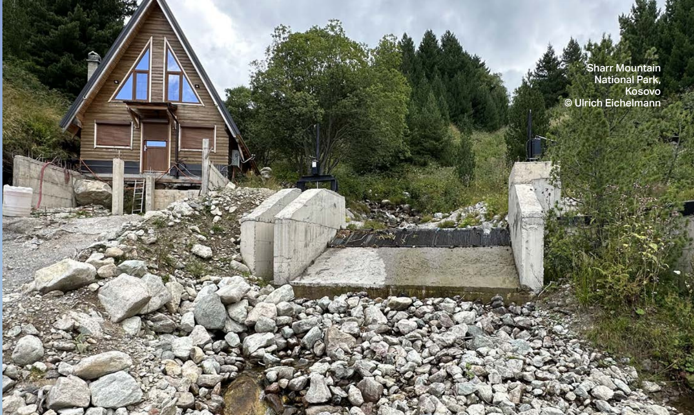
Sharr Mountain National Park, Kosovo

Article 3 of the SEA Directive was transposed by Article 2 of the draft Law , which states that the SEA shall be mandatory for plans and programmes initiated by local and central authorities which are likely to cause significant environmental impact for agriculture, forestry, fishing, energy, industry, transport, waste management, water management, telecommunications, tourism, city and country planning or land use, and which set the framework for the future development approval of the projects listed in Annex I and Annex II of the Law on Environmental Impact Assessment; or which are likely to have an impact on the nature protection areas, identified NATURA 2000 areas, and other areas in accordance with the relevant Law on Nature Protection.